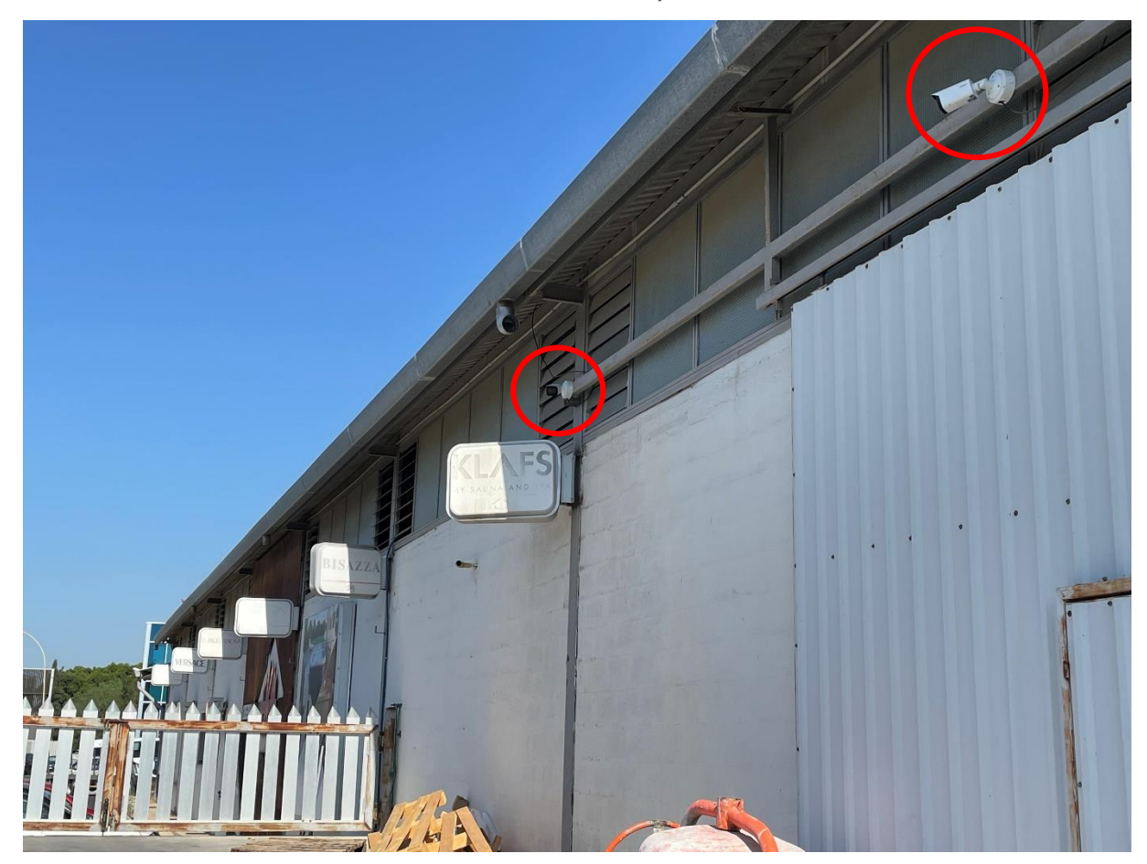
Figure 6 DAHUA Network Cameras, outdoors, facing entrances and corridors