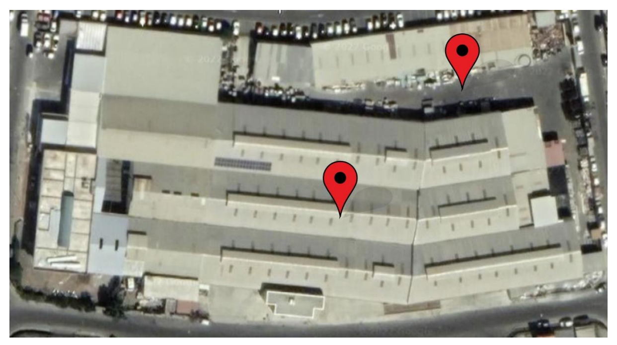
Figure 4 EKA's warehouse satellite view. Cameras installation areas.

In the pictures exhibited below we can see some of the camera placements highlighted in red circles (Fig.5, Fig.6).