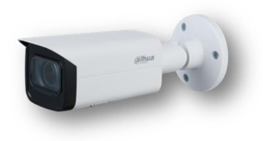
Figure 3 Dahua Network Camera

As a solution to EKA's problem, ITOLOGY utilized Dahua Network cameras (Fig.3), which were installed indoors and outdoors (Fig.4), based on the security plan that was agreed on by the expert individuals from both companies.