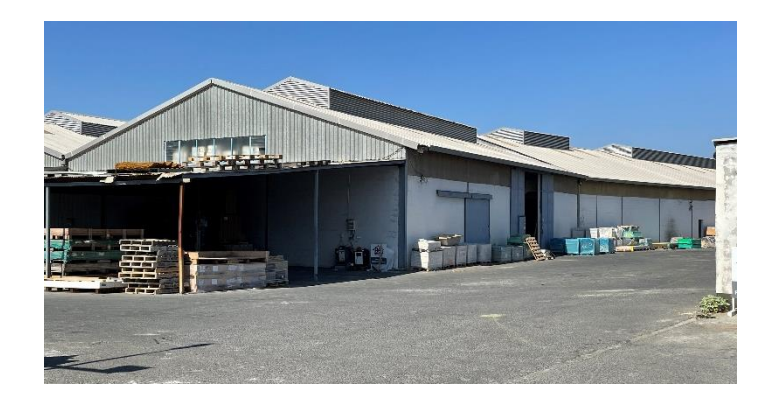
Figure 2 EKA Group's main warehouse

Based in Limassol, EKA Group's main Warehouse, located in an industrial area of Limassol, consists of the main warehouse as well as additional covered and uncovered areas in which the supplies and products are stored.